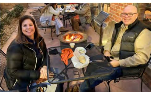
Saline Main Street Fire Pits Winterization