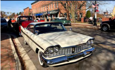
University of Michigan Antique Auto Rally