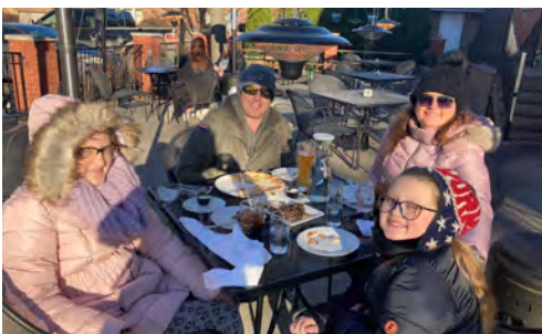
Eating Outdoors This Winter