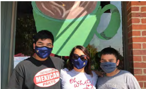
Downtown Day Michigan Window Painting