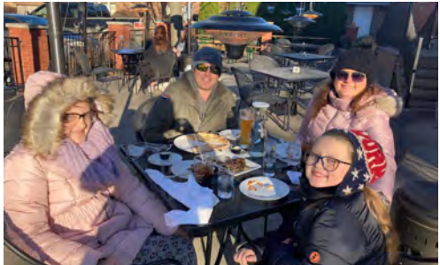
Eating Outdoors This Winter