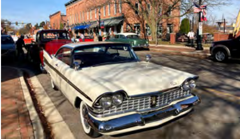
University of Michigan Antique Auto Rally

Shake It Out Saline T-shirt Drive Small Business Saturday Small Biz Reboot for Downtown Saline Holidays by the Campfire