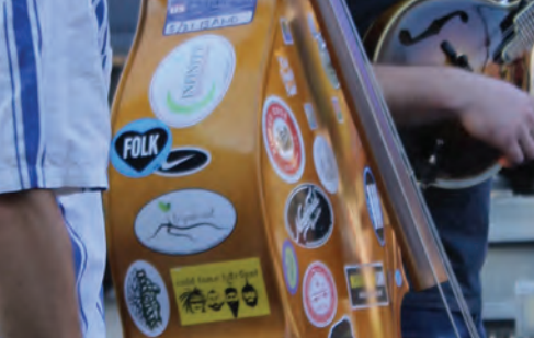
Thunderwüde plays Celtic in Saline's Northside