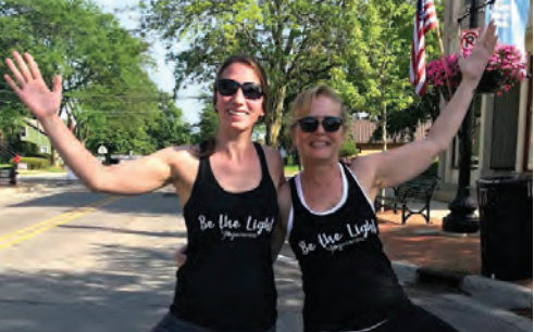
Be the Light! Yogacentric on the yellow lines