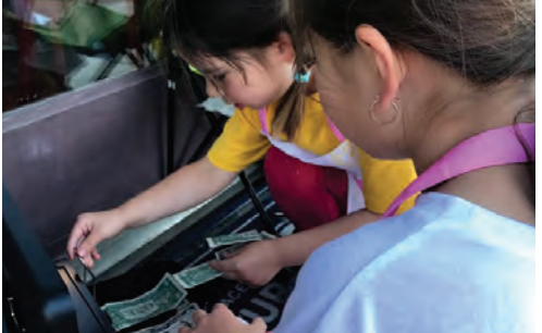
Entrepreneur kids open shop on Lemonade Day