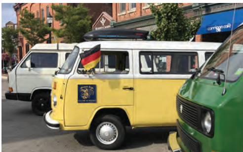
Volkswagen buses line up at Oktoberfest