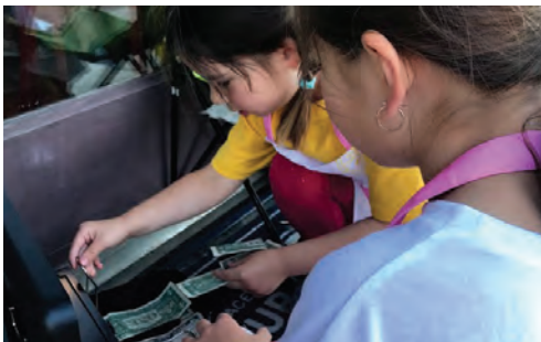
Entrepreneur kids open shop on Lemonade Day