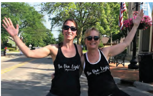
Be the Light! Yogacentric on the yellow lines