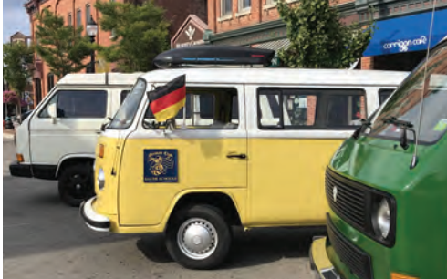
Volkswagen buses line up at Oktoberfest