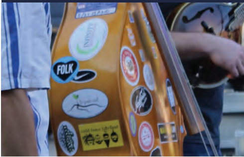
Thunderwüde plays Celtic in Saline's Northside